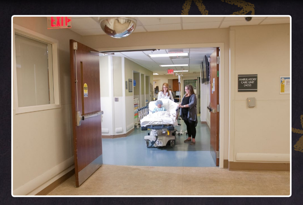
This is the doorway where you give your family a hug and kiss and say, 'see you in a little bit.'