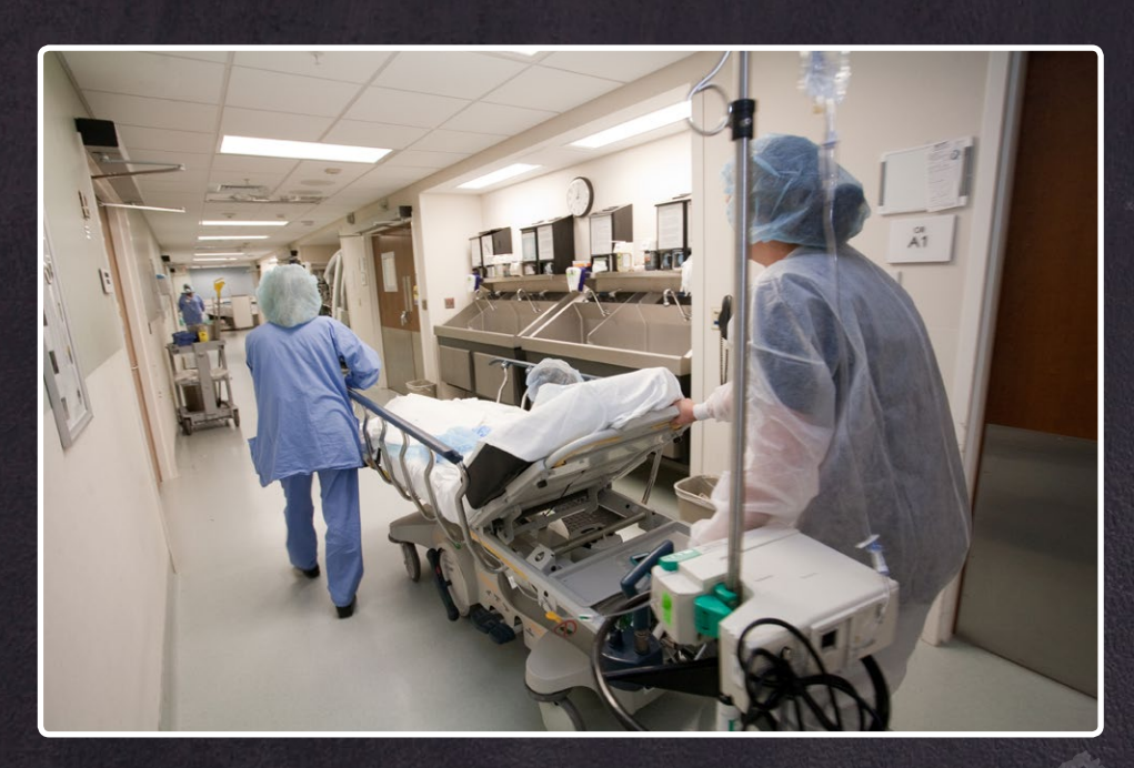
Next, the nurses will take you through this hallway leading to the operating room.