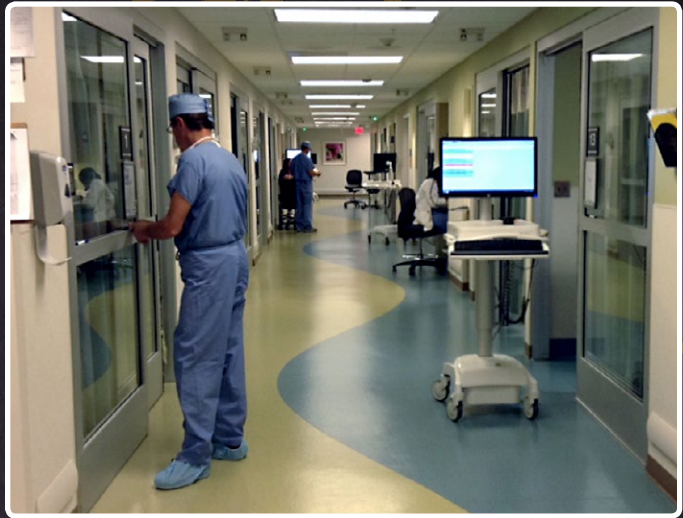
This is the hallway leading to the pre-op rooms.

A nurse will wheel your bed to the operating room from here.